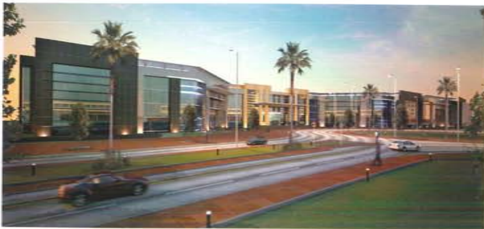
Above: A Mimar-designed commercial and office building located in Dubai Investment Park.

Having been a typical British expatriate in Dubai for over a decade – which by and large means I can only speak one language – I’ve driven past the EMAAR business park by The Greens, noticed the EMAAR sign, wondered exactly where the name EMAAR came from and driven on. And guess what? Despite being a journalist – I use that word in the loosest possible way – I’ve never bothered to check and find out what the word meant. Well, I’m proud to announce, I have expanded my knowledge of Arabic beyond ‘hello’ ‘goodbye’ and the usual words you hear Brits say in their attempt not to appear ignorant. Emaar is an Arabic noun and it means something along the lines of ‘the process of building’.