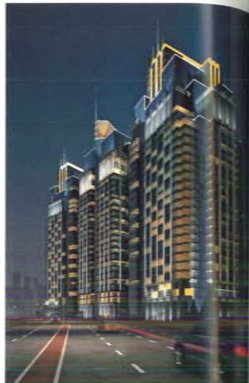
This spread: Mimar's work encompasses every facet of architectural design, from villas and residential towers to tourism projects and offices buildings, hotels and educational establishments, all over the Gulf region.