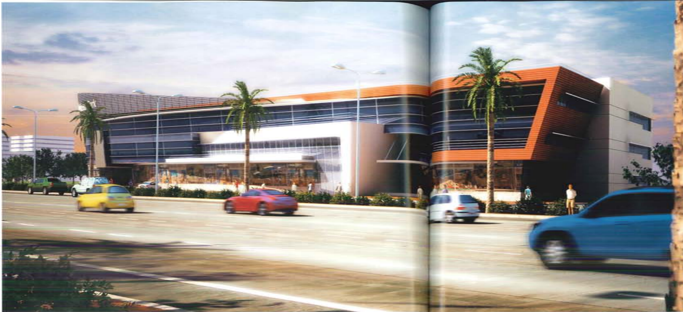
Futuristic angular buildings with clean lines and startling geometry, appear in many of Mimar's developments.

office here in the Emirates. The second step was to develop the organisation and bring in key people and produce good quality work. Number three is spreading our name and making our organisation even stronger, making the people that we rely on even better and better. There are seven more steps to go. Step ten is when Mimar is the number one consultant in UAE. So yes, to meet my goal, I need to be the best consultant in the country by 2020." II