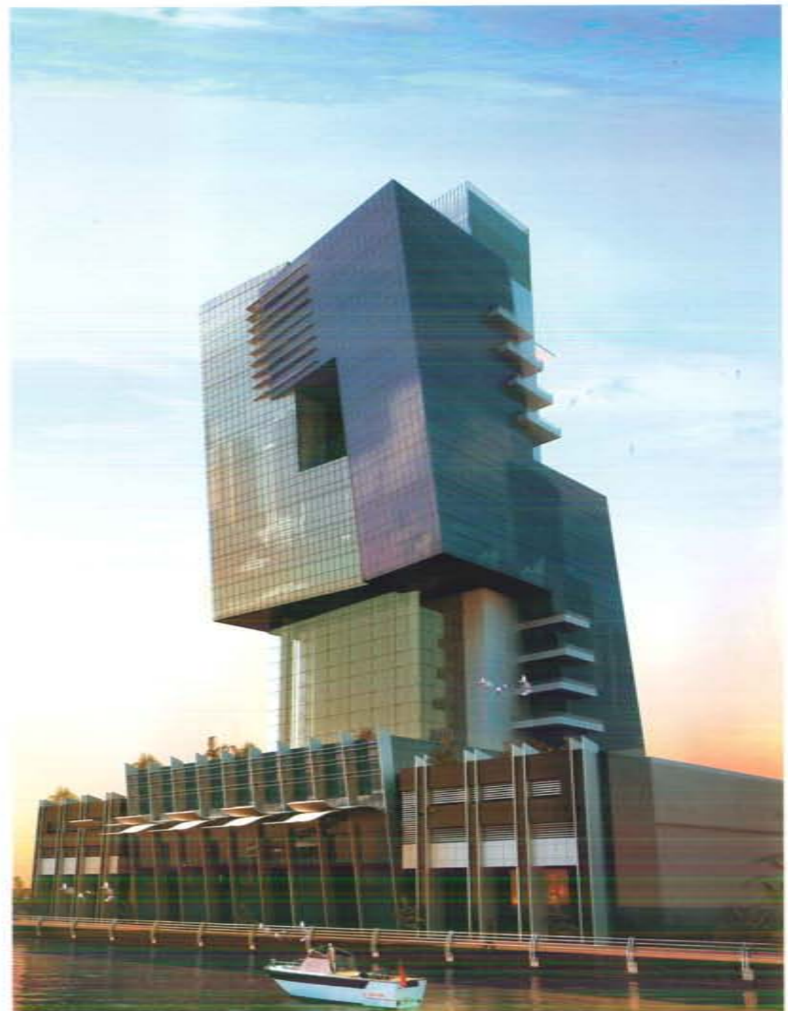
Above: One of Mimar's stunning commercial projects, an office building in Dubai's Business Bay, is reminiscent of Frank Gehry's 'Fred and Ginger' building.